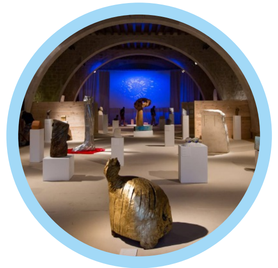
Museum of Hvar